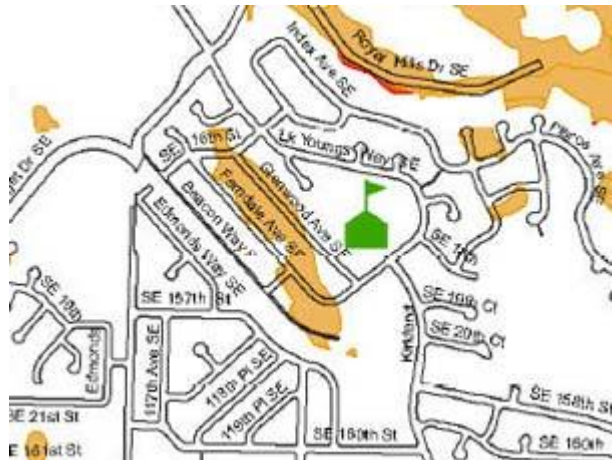
Landslide hazard areas

The following is an example of the Landslide hazard area map which has been cropped to display just the Tiffany Park area.